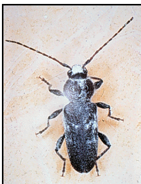
ROUNDHEADED WOOD BORER

Many insects attack dead or dying trees. Their activities ensure that the resources in the wood are broken down and recycled. Beetles are the most common group found developing in firewood. These include roundheaded wood borers, flatheaded wood borers, and shothole borers, also called powderpost beetles.