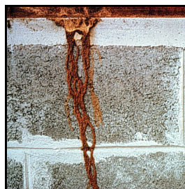
TERMITE MUD TUNNELS